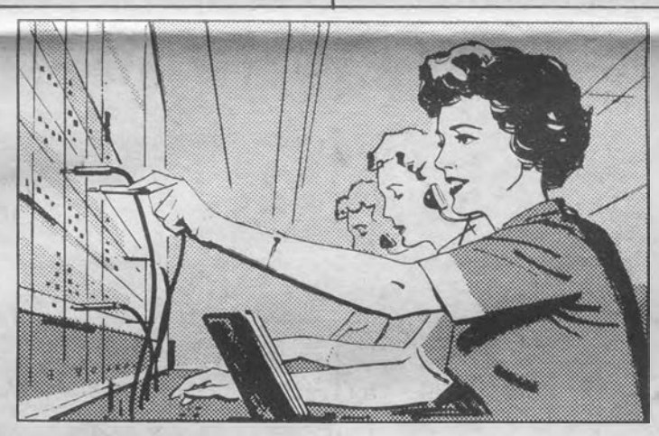
Over 6,000 New Jersey Bell operators serve almost 2,000,000 customers.

The budget that will be presented to the voters for their approval on February 13, 1963 could easily be pared by 70,000 to 100,000 dollars, perhaps even more. The raise that is given to teachers, over and above their normal raise, is averaging $430.00. Why couldn't this have been spread over two years," Bridge Boy Scouts of America